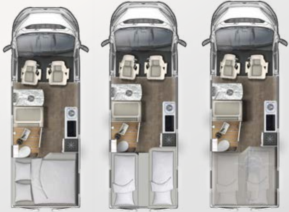
V 595 HB