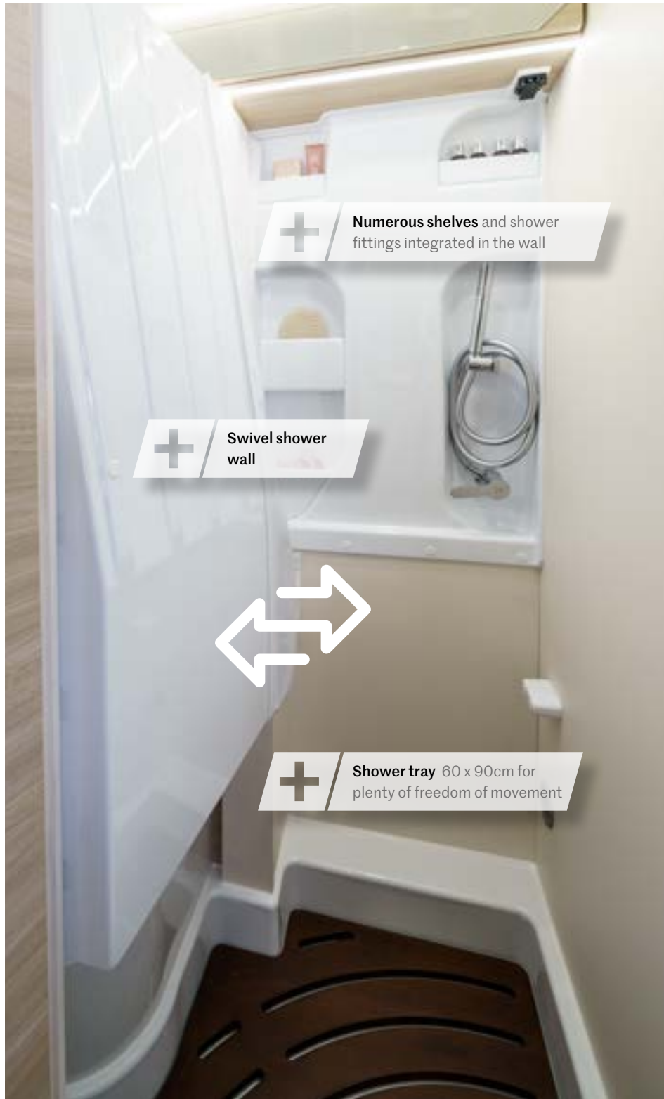
+ Numerous shelves and shower fittings integrated in the wall