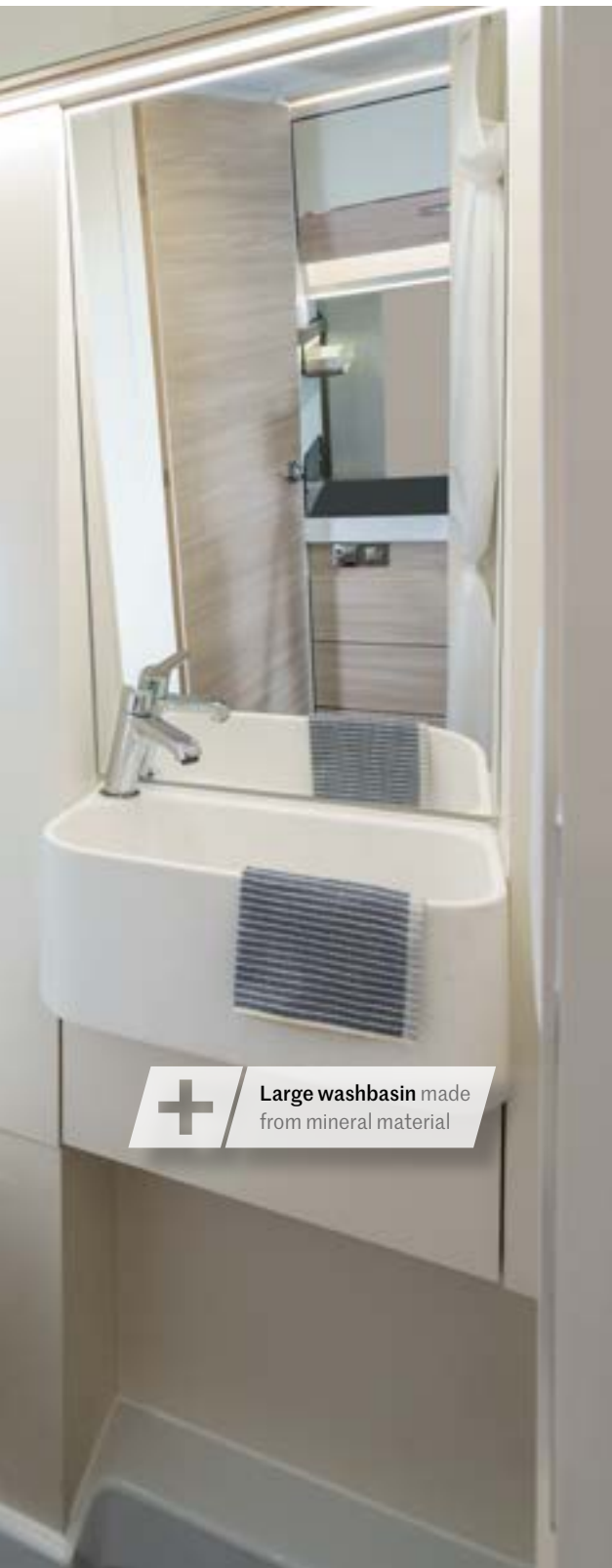
+ Large washbasin made from mineral material